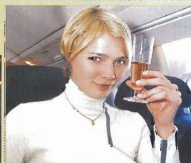
Supermodel Jodie Kidd gives a toast with her flute of champagne.

Music men Lenny Kravitz and JC Chasez bond over some sweet libations.