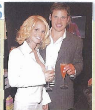
Newlyweds Jessica Simpson and Nick Lachey are still toasting their wedded bliss.