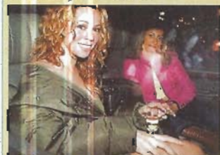
Diva luscious songstress Mariah Carey sips her bubbly in style.