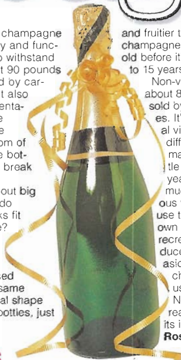
Bottles: © Getty Images; contents in photos used to illustrate story only.

Blanc de Blanc: Some champagnes are made from just one of the three permitted grapes. A blanc de blanc (meaning white wine from white grapes) is made from 100 percent Chardonnay grapes and is lighter than champagnes that also include Pinot Noir. It can be vintage or non-vintage.